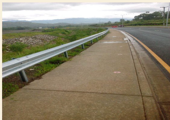
Ezy - guard rail installed at the newly constructed 6mile/Bautama road in Port Moresby