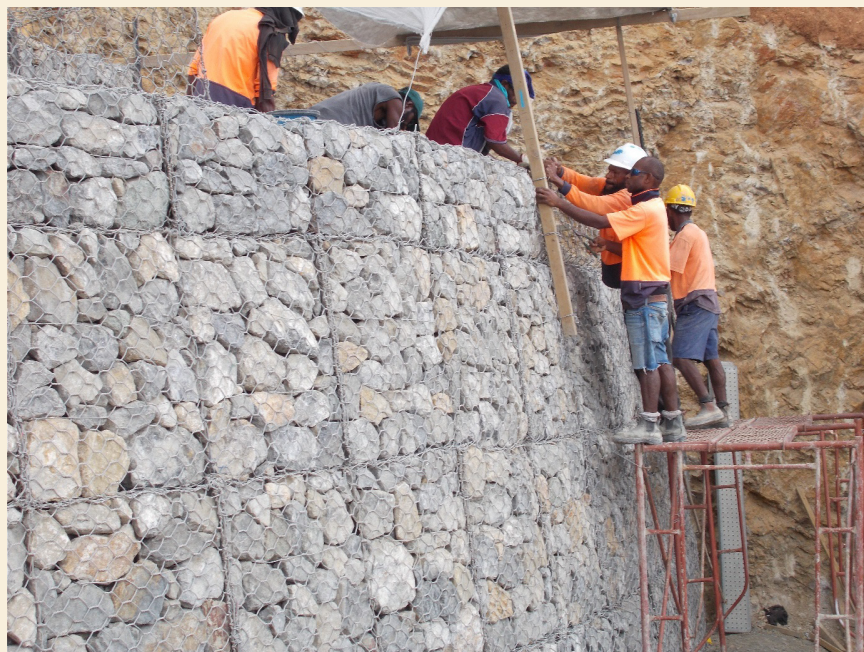
Workers building a retaining wall at the new Hilton hotel using PVC coated gabions basket supplied by Markham Culverts