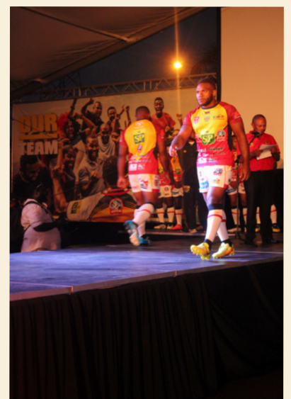
The new Jersey being presented at the launching